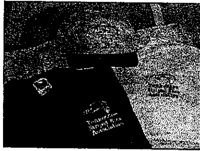
Hats, T-shirts, pictured Right.