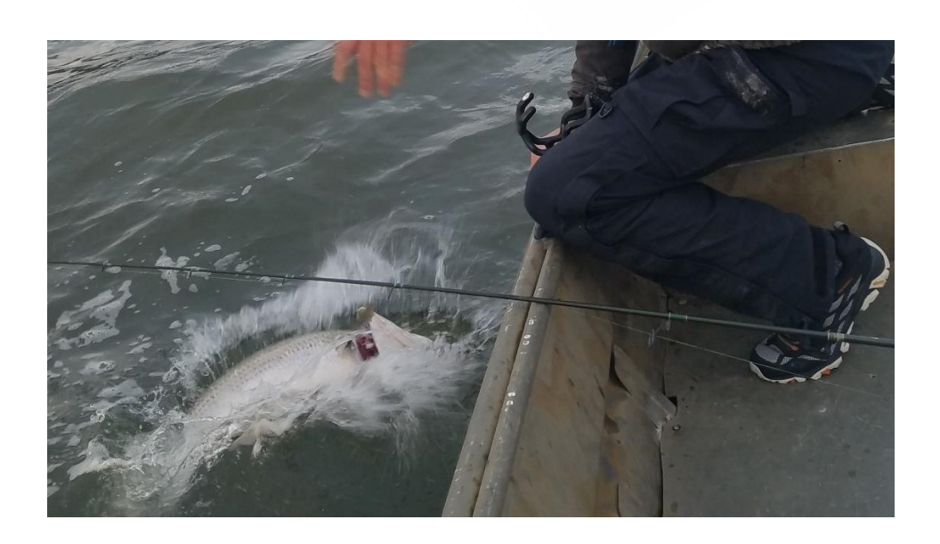
Thrill of the hunt!