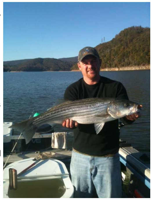
The author with a nice catch made on Cherokee Lake this past November.

In the early 1990's, I became interested in fishing for striped bass. I was able to catch some stripers on Lake Cumberland using artificial lures at night; I had some success on Norris Lake as well. In 1997 I began to fish the Powell side of Norris lake on a regular basis, and this is where I was