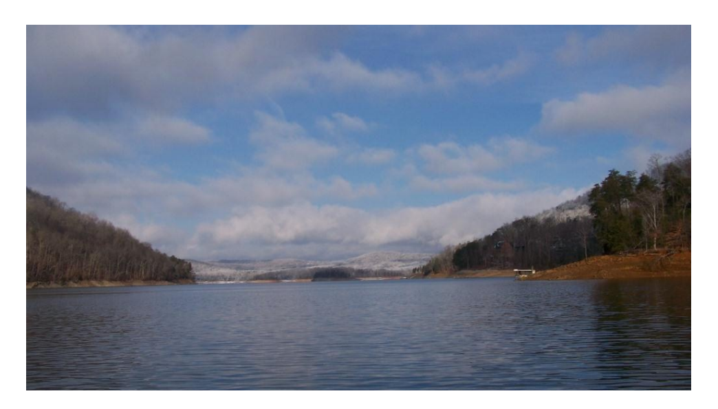
Don't put away your tackle just yet! Winter can be a rewarding and enjoyable season to be out on the water. Be sure to attend this month's meeting to learn methods to maximize your winter fishing opportunities.