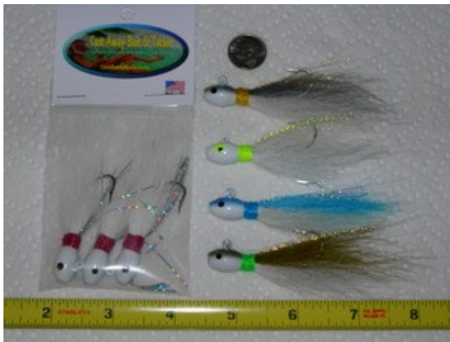
These 1/4 and 3/8 - ounce egghead bucktails are an example of the type of artificial lure Jim and Lisa Farmer like to use for catching a nice early striper or a pre-spawning bass.