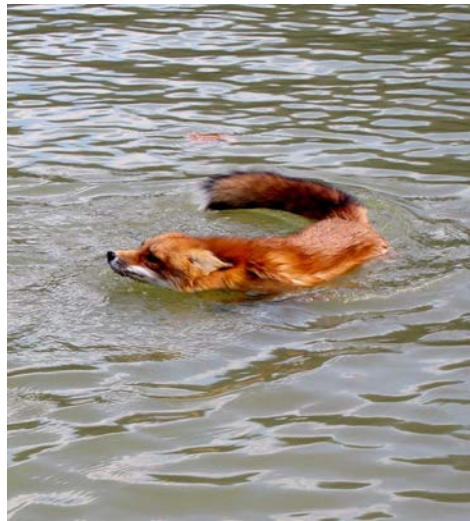
One of the many perks of fishing is catching glimpses of wildlife, like this fox I saw swimming across the channel of Norris Lake a few weeks ago.

Early spring is a wonderful time to be on the water, it is a great cure for cabin fever. So call up a friend, look up a fishing report, attend a TSBA meeting and most important of all.... take the time to GO FISHING!