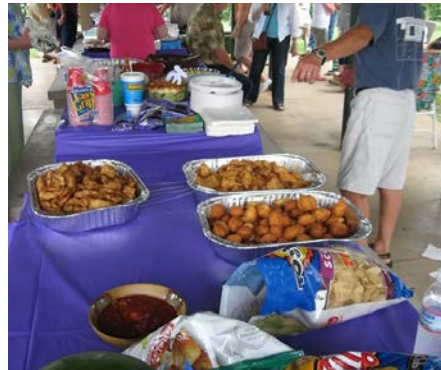
The feast will begin at 4 p.m.