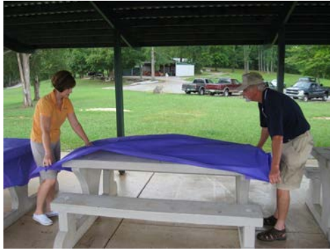
The tables will be prepared.