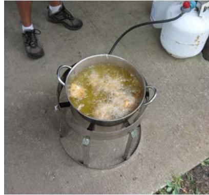
The fish cooks will be busy.