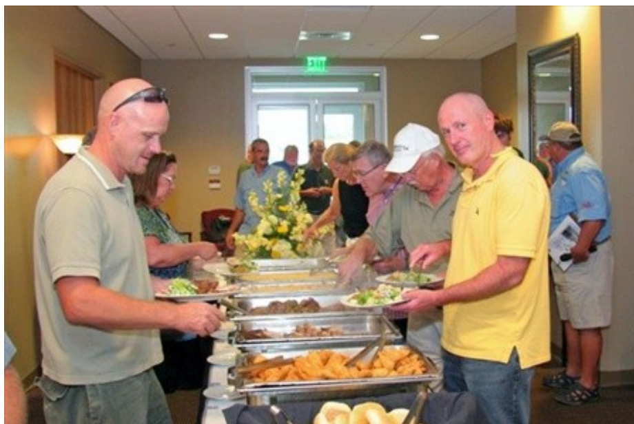
Everyone seemed happy with the buffet.