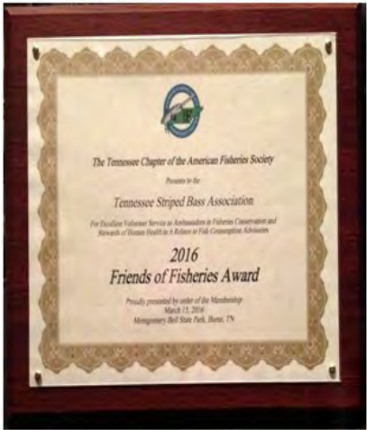
2016 Friends of Fisheries Award