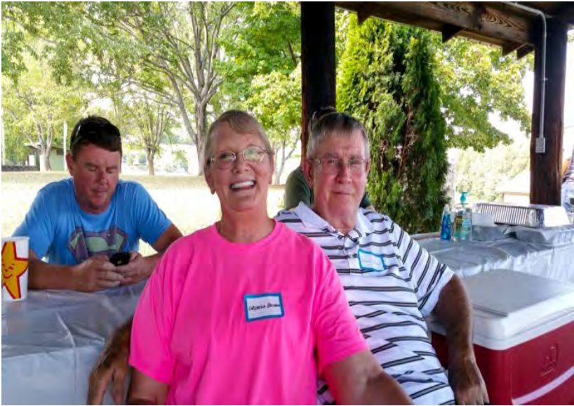
Enjoying the day with club members.