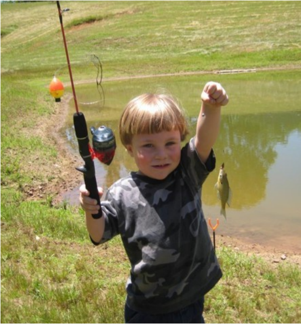
Having fun fishing !