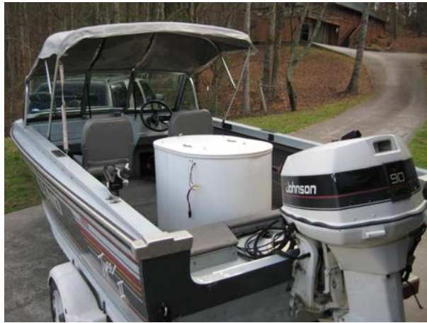
The Lund is a good choice to meet the needs of a striped bass fisherman.

Super Tank II, and all the other necessary items. I have since been upgrading equipment and will continue upgrading as time progresses. The boat I have now is smaller and older, but I bet she catches as many fish. I know she is more comfortable for the fishing I'm doing at this point in time. Maybe someday I'll find the Perfect Boat for all my needs, but that's another boat story (2002 Crestliner in the garage) and (bass boat for sale if anyone is looking).