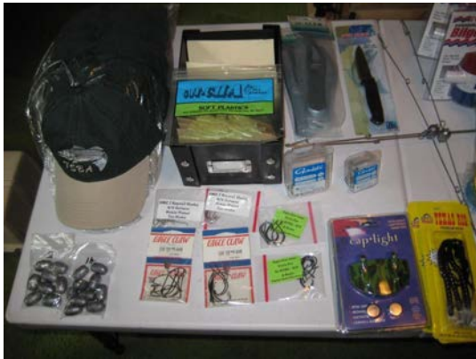
The supply closet is currently stocked with hooks, 1.5 and 2-ounce sinkers, u-rig arms, bait tank pumps and a pair of Bud White planner boards. Memphis brand nets in 7 ft., 5/8 inch mesh are arriving this month.