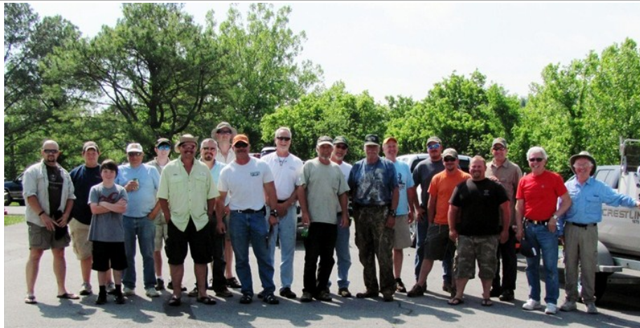
Participants of the April 29, 2012, spring tournament on Watts Bar. Don't let their tough guy appearance fool you: these guys are ready to share their expertise with you. TSBA has several tournaments planned throughout the year and we are hoping more members will come and join in on the excitement of the friendly competition.

Expect to find the thermocline starting to develop and get deeper in the stratified calm waters with 80 + degrees on the surface. Striped bass are temperate bass, so seek out the deeper, cooler temperatures. The gizzard and threadfin shad will seek out the warmest water they can find and the stripers will follow them to feed and then return to their thermal refuge quickly. The alewife will complete spawning early this month so night time bites will still be good on the reservoirs. The gulls, cormorants and herons can be a great help in locating the baitfish even if they are not feeding. The striper and bait-eating birds will be where the bait is most abundant. Artificial baits can be very productive this time of year. You may want to try JIGGING, CASTING, OR TROLLING. Umbrella rigs have become a favorite method the last several years. Be aware of the new floating debris on the lake; this will be a concern until the wind pushes it into the coves. Large live bait is working well again and normally easy to catch this time of year.